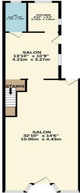
1ST FLOOR 622 sq ft. (57.3 sq.m.) approx.